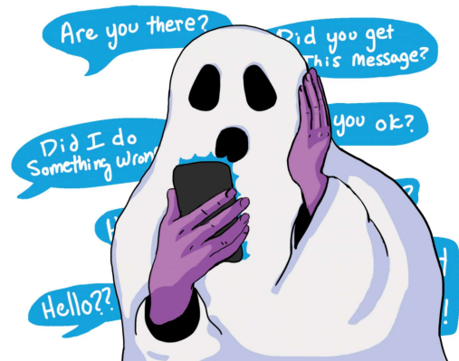
abb9c237-b4c7-4fa0-a05f-de5f9c080c18.sized-1000x1000.png (164.91 KB)

James Driskill is sharing a file with you